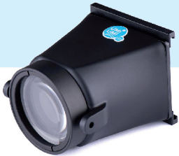
UU-LCDMAX01 Underwater LCD Display Magnifier [UU-500101]